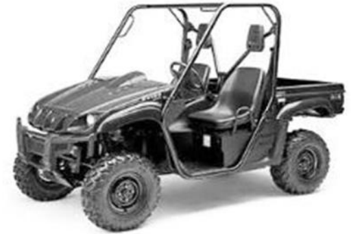
Utility-Terrain Vehicle (UTV)