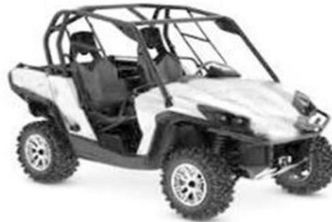
Side-by-Side Off-Road Vehicle (ORV)