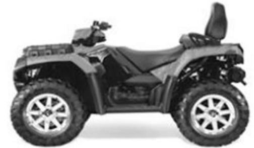
Two-up All-Terrain Vehicle (ATV)