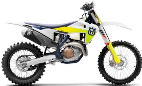
Off-Road Motorcycles (ORM)