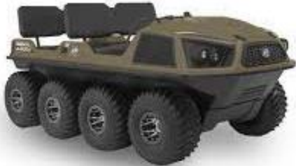
Extreme Terrain Vehicles (XTV's)