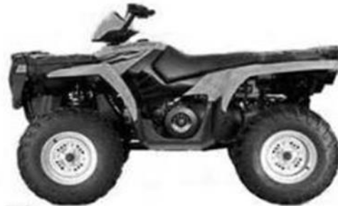
Single-Rider All-Terrain Vehicle (ATV)