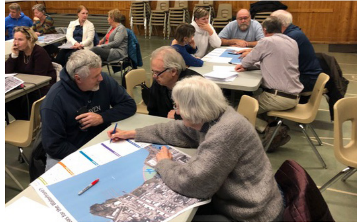
Workshop for Port Perry Waterfront Action Plan

The number of visits to the community will depend on decisions regarding in person or virtual meetings. Assuming all are in person, we estimate 10+ visits to Beaverton with at least one member of the team. Typically multiple members of the team will be in attendance at these visits.