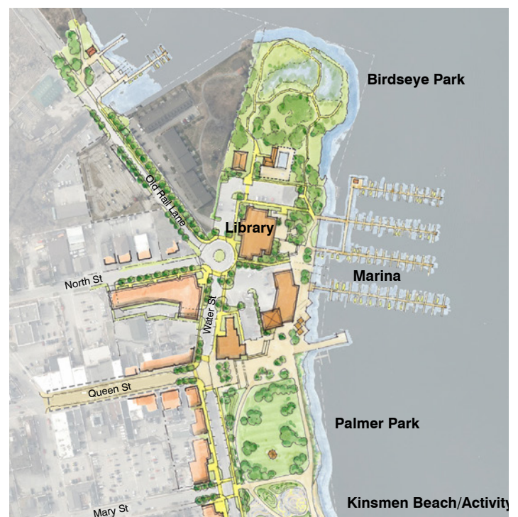
Preferred concept from Port Pery Waterfront Action Plan