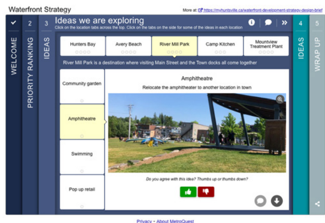
Example of Metroquest survey for Huntsville Waterfront Strategy