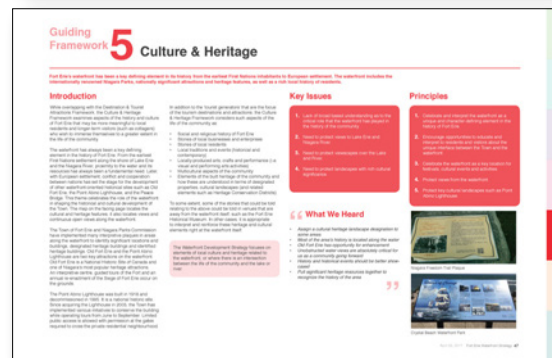
Pages from Fort Erie Waterfront Strategy final report