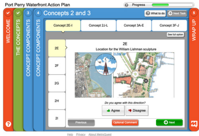
Example of Metroquest survey for Port Perry Waterfront Action Plan