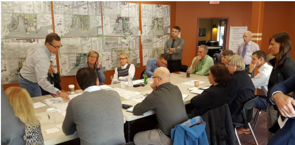
Workshops for Kingston Penitentiary and Portsmouth Olympic Harbour Visioning (bottom) and Bowmanville Zoo (top)