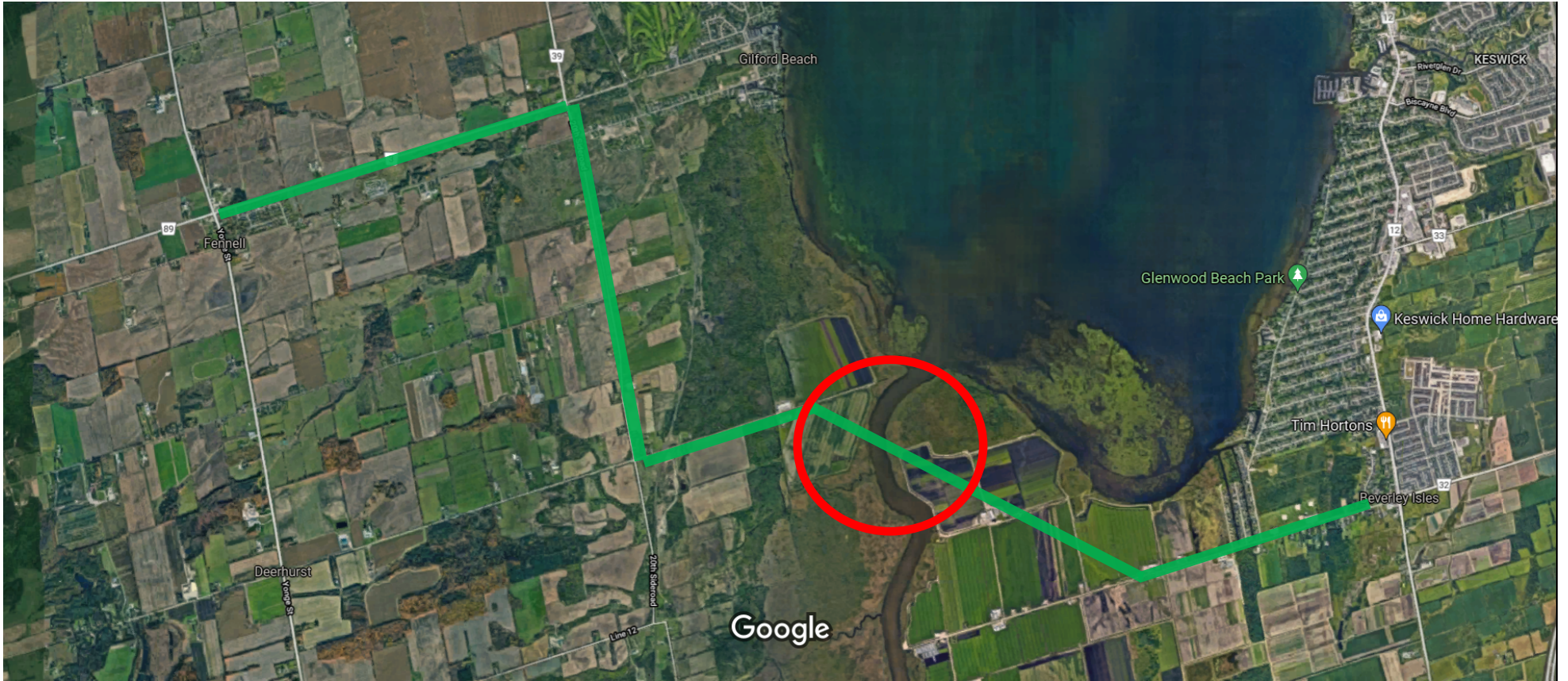
Imagery ©2021 Google, Imagery ©2021 CNES / Airbus, First Base Solutions, Landsat / Copernicus, Maxar Technologies, Map data ©2021 1 km

Connect Ravenshoe Road to Hyw 89 via Line 13 and 20th Sideroad