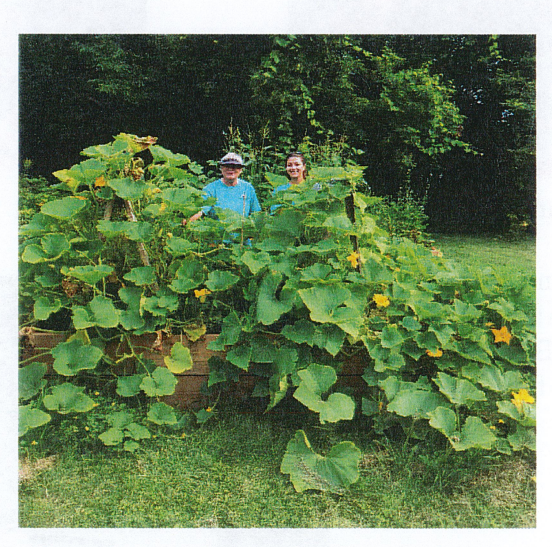
Squash out of control at Fox Park