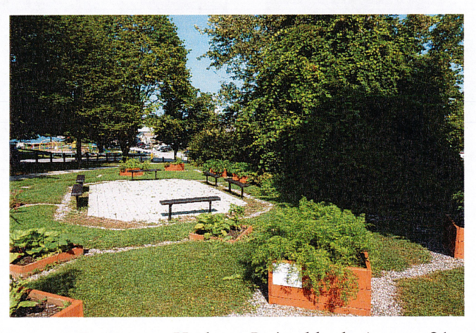
Beaverton Harbour Raised beds August 21