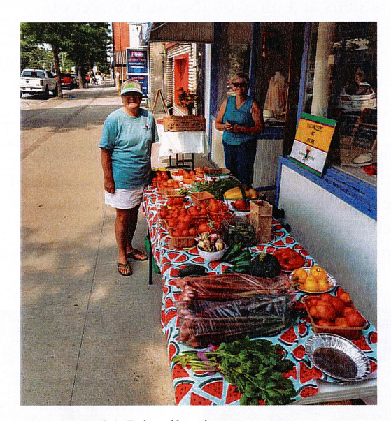
August 21 Distribution

We are interested in continuing the Harbour raised bed project for next year, 2022, subject to Council approval. It would be helpful if we could receive direction from Council this Fall in order to help the Beaverton Horticultural Society with planning and budgeting for 2022.