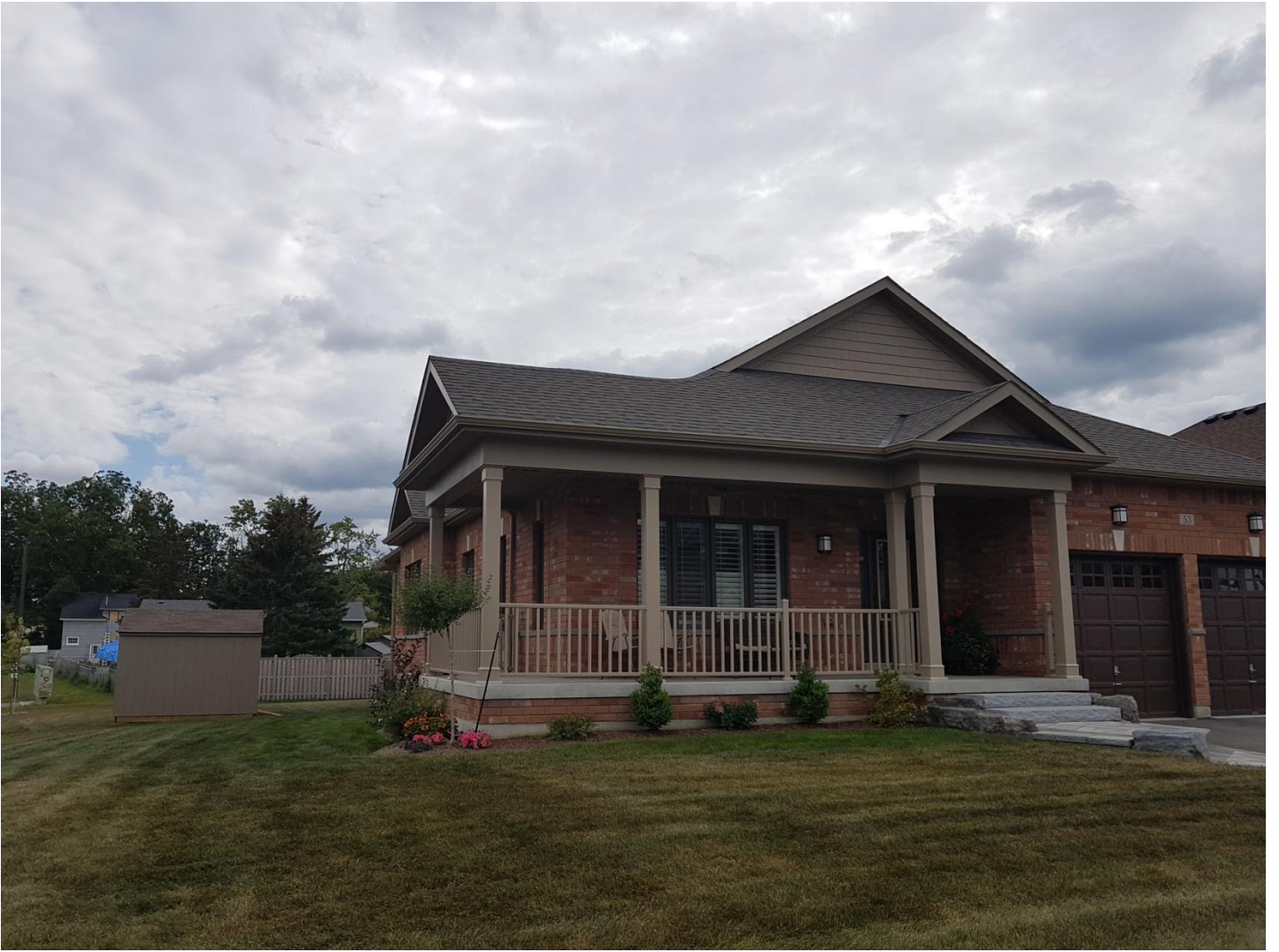
View of front of home [REDACTED] Note shed in background.