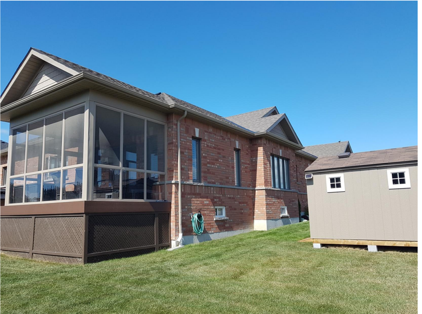
Back corner of home where fence was to be attached.