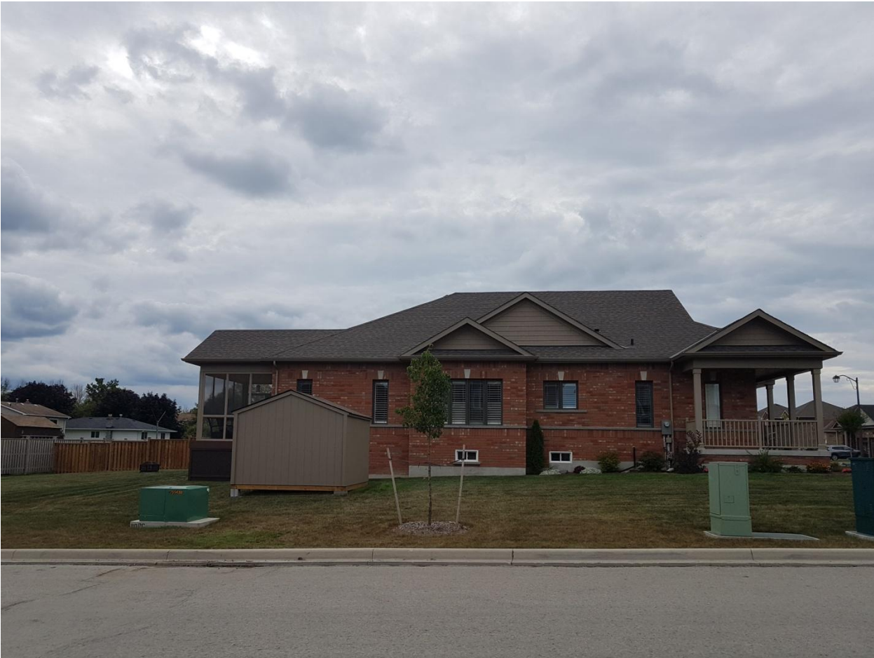
Sidyard view from [REDACTED]. Fence to extend to bump out on house just past the shed.