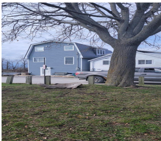
Under the Maple Tree beside the Bench