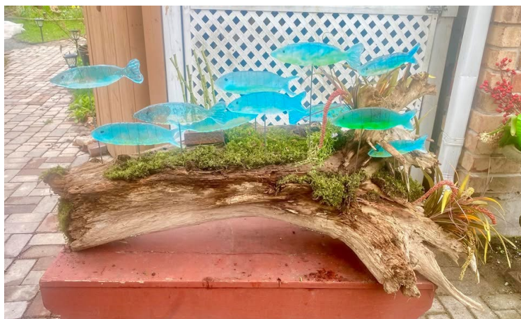
Beaverton Harbour Park