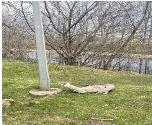
Beside the Lamp Post