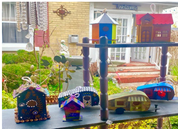
Colourful Bird Houses