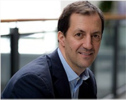
Andrew Coyne, Political Journalist

Former national editor of Maclean's magazine, current columnist with the Globe and Mail and panelist on CBC's The National "At Issue," Mr. Coyne will speak to current affairs, emerging and potential threats to democracy, and how municipal leaders can navigate the declining tone of discourse between elected officials and community members.