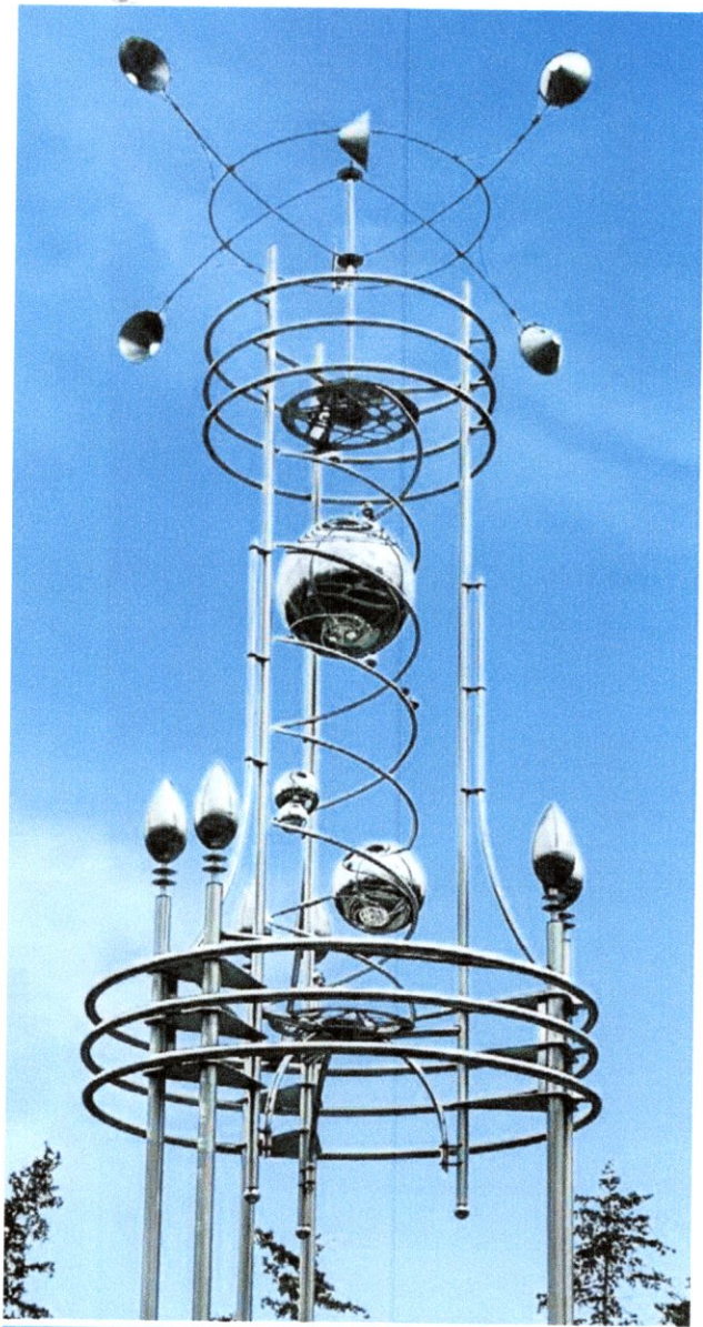
The Wishing Tower Beaverton Harbour