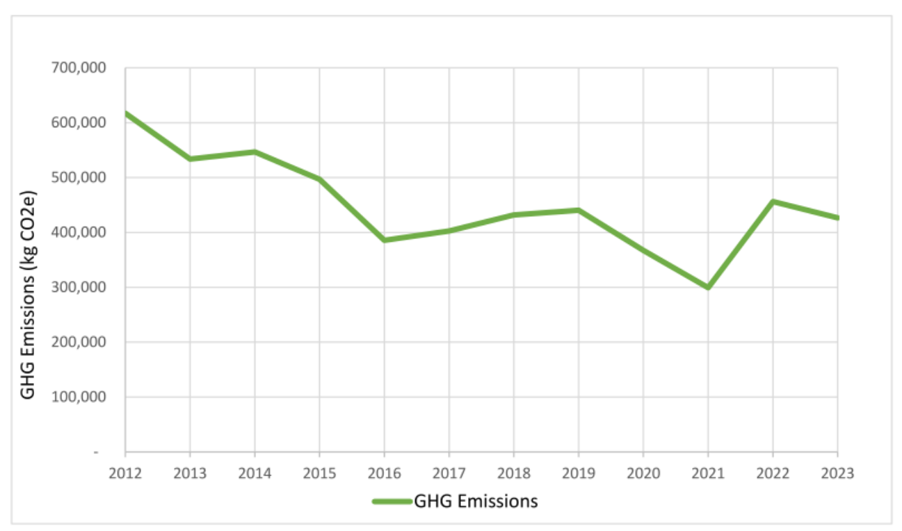
Figure 6: GHG Emissions (tonnes CO2e) from 2019 to 2023