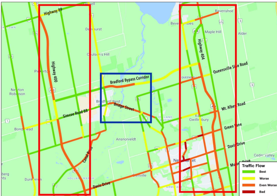
2041 Forecasted travel volumes with Bradford Bypass